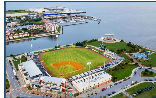
Community Maritime Park