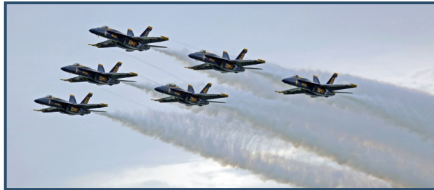
U.S Navy Blue Angels

As an Assistant State Attorney your primary role is to represent the State of Florida in criminal cases. As a prosecutor you'll have the backup and support of investigators, victim advocates, legal assistants, and IT personnel. If you care deeply about maintaining and enforcing the rule of law, find criminal law and litigation stimulating, and have a desire to help victims, a career in prosecution could be the right choice for you!